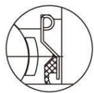
H TYPE SEAL